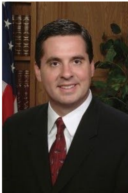
Cities in CA-22: Eastern Fresno , Clovis, Reedley, Tulare, Visalia

Paid for by Field Team 6 ( www.fieldteam6.org ) and not authorized by any candidate or candidate's committee.